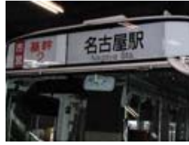
Key Route Bus: White