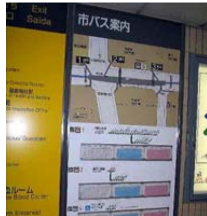
Bus Information Board