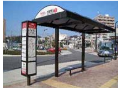
Bus stop with roof