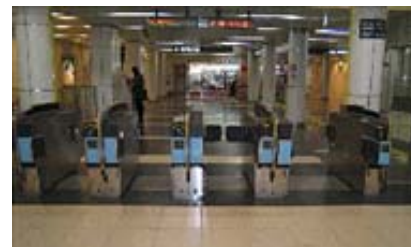
Automatic Ticket Gates

Automatic ticket gates are set up at every station. Insert your ticket into the slot on the ticket gate to pass through. Please do not forget to take your ticket when you go through the wicket.