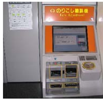
Fare Adjustment Machine

Once again insert your ticket into the slot in the ticket gate to pass through. Regular tickets will remain in the gate, but 1 day tickets will be returned to you, so please do not forget to take them.