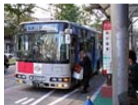
Downtown Loop Bus