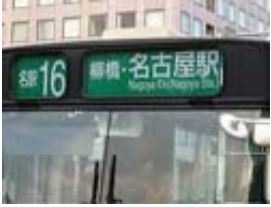
Bus bound for Nagoya Station: Green