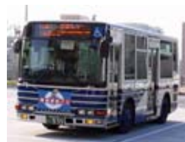
Local Circuit Bus

※City Bus route sign colors vary according to bus service and destination.