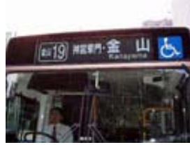
Bus bound for Kanayama: Black