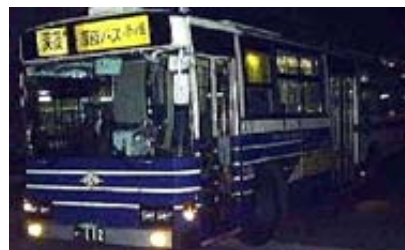
Late Night Bus

(bus fare is reduced to half price with the use of a commuter pass for the traveled area, or with a 1 day ticket)