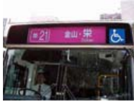
Bus bound for Sakae: Pink