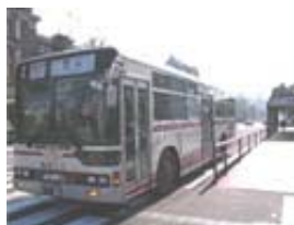
Key Route Bus