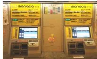
Ticket Vending Machines

※ Instructions on how to purchase a regular ticket and 1 day tickets are posted near the ticket vending machines.