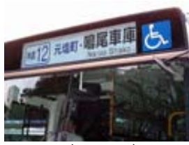
General (Regular): White