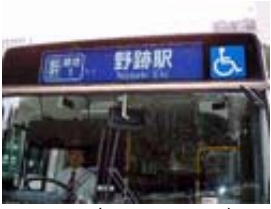
General (Main Route): Blue