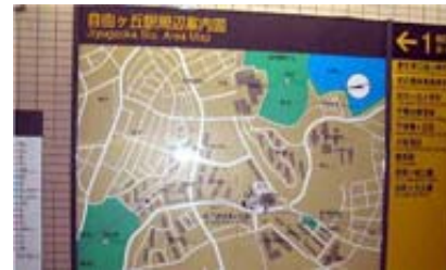
Station Area Map

Should you have any questions, please ask a station staff member.