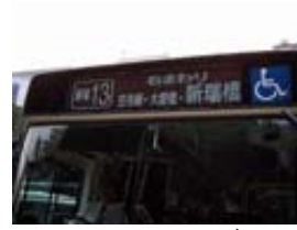
Local Circuit Bus (right loop): Brown