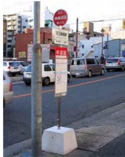
Local Circuit Bus Stop