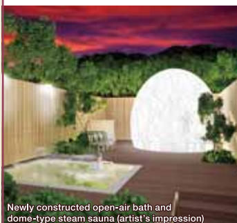
Newly constructed open-air bath and dome-type steam sauna (artist's impression)